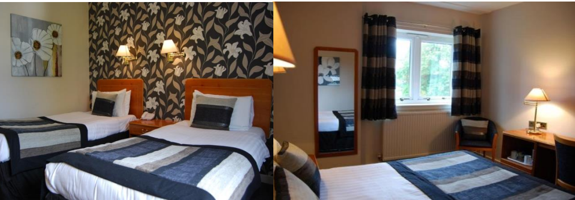
Insert: Standard Double and Twin Bedrooms

Our Double & Twin Rooms are located in our new wing, modernised and perfect for short stays.