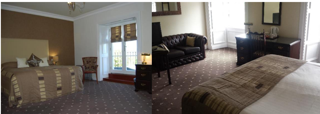
Insert: Premier Bedrooms

Do you require extra bedding? We can set up a cot, or an additional z-bed for children up to 12 years. (Additional charge for child bed occurs; please request in advance)